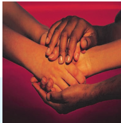
Hand to hand and heart to heart, sharing Christ's love...

If you lose a loved one, please call our office immediately. A very important part of our ministry is to be with you and your family during the loss of a loved one. We will offer God's strength and companionship, answer questions, and can help you plan a service to celebrate the life of your loved one.